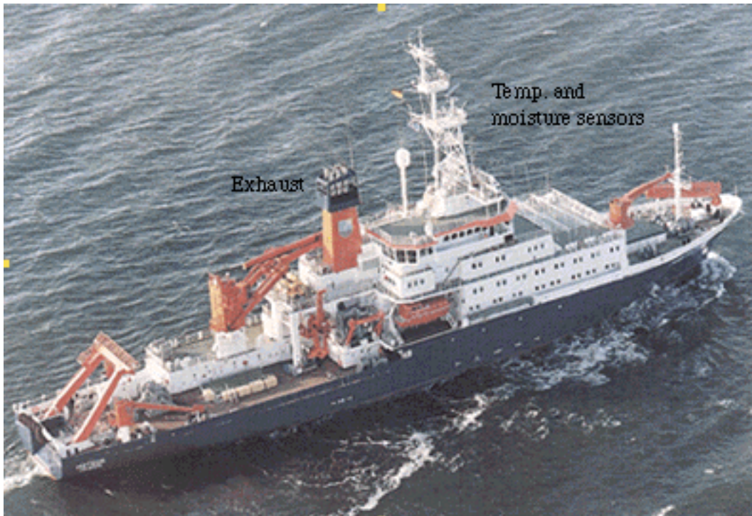
Figure 1: Research Vessel Meteor

The analyst attempted to flag all exhaust events with a “K”. Differences in response time and exposure of the instruments resulted in varying times and amounts of flagging among the six different variables. In addition, the exhaust problem was not always discernable from normal background noise and some events may not have been flagged completely in all of the variables. The user may wish to apply an automated filter based on ship-relative wind direction, but such a task was beyond the scope of DAC quality control procedures. Figure 2 shows a typical plot of T, TD, RH, and PL_WDIR and the flagging of these variables.